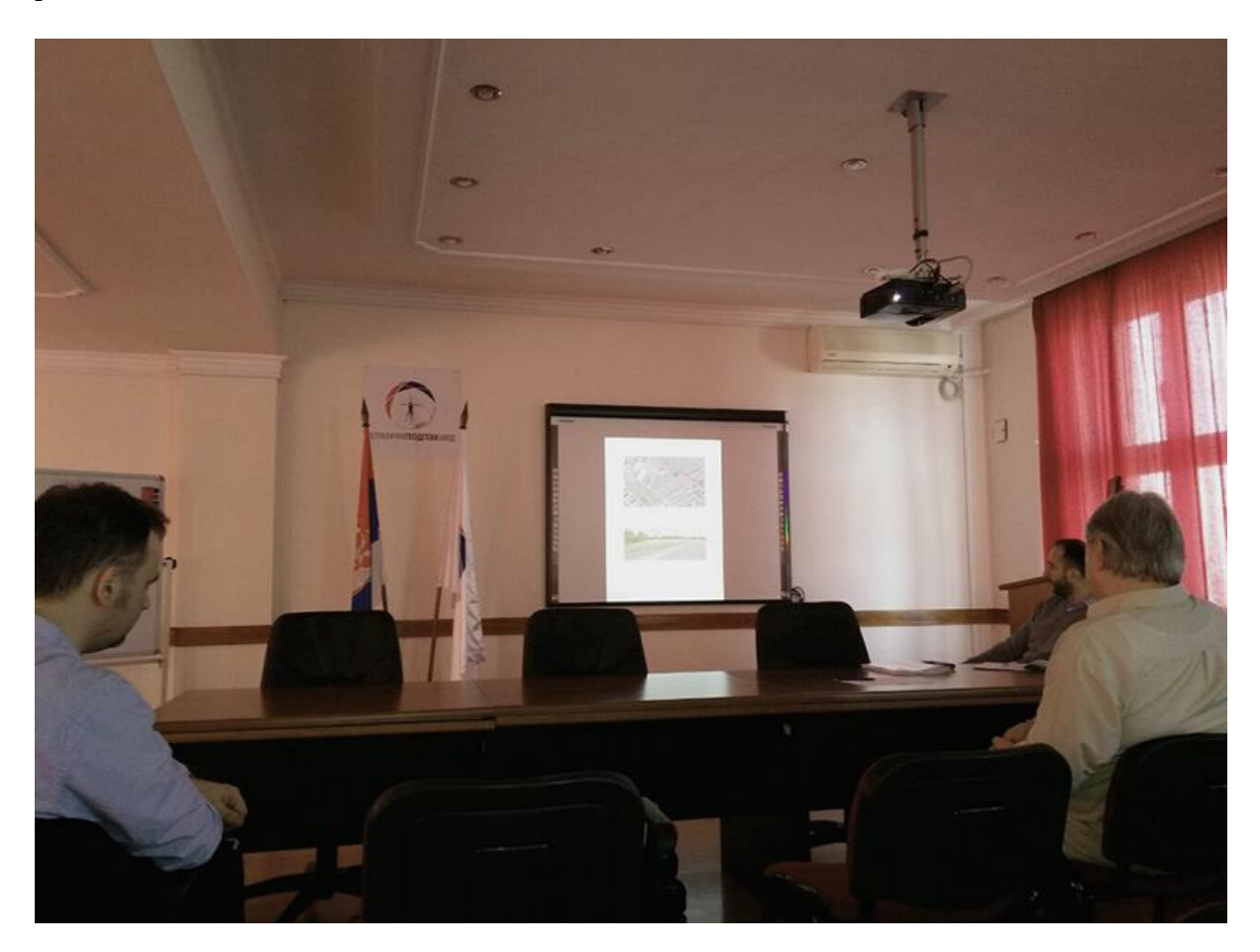
Photo No.1 Public Consultation meeting at RGA's headquarters in Belgrade.

The meeting started according to schedule at 10:00AM. The EMP document was presented in details to the interested attendees by the PIU's representative. During the public consultations there were no significant remarks or comments made in regards to the environmental protection issues.